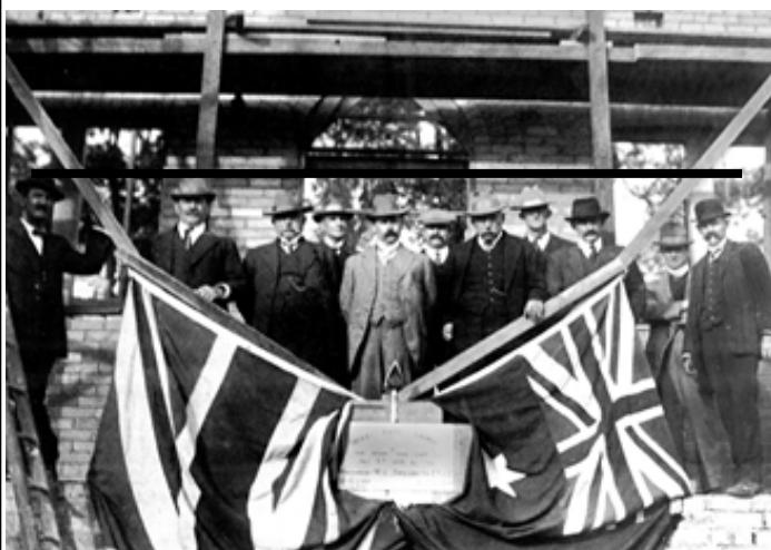
Unveiling of the foundation Stone in 1915