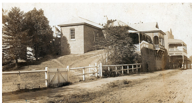
The 1879 Court House