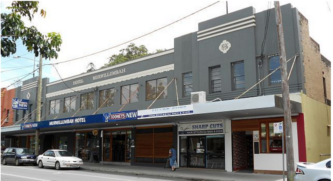
The refurbished Murwillumbah Hotel gracing Wharf Street in November 2012

when the sample rooms provided for travelling salespeople were not needed they were used to play cards for gambling, including playing poker.