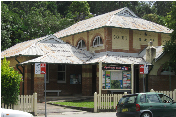
The 1909 Court House (photo: David Taylor, December 2012)

The Australian Heritage Commission description is "A symmetrically arranged Court House having a central pavilion for the courtroom flanked by lower