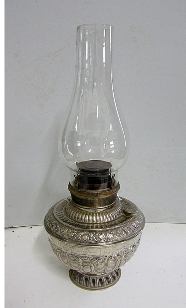
One of the old Juno lamps (TRRM Collection MUS1970.17)

single storey wings containing offices and jury rooms. It is constructed of face brick with relief given by pebble dash stuccoed panels and decorations to piers. Interest is given by arched clerestory lights and colonnade like entrances. The roof is a series of hipped forms sheeted in corrugated iron".