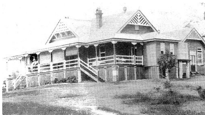
The Cottage Hospital

The first move to open a public hospital in Murwillumbah was in 1899 when the town was growing and already supporting 2 hotels. A committee was formed, held a bazaar and raised £200 (a lot of money in those days). But the wheels of government move slowly and it was not until 1903 that the foundation stone was laid by the governor of New South Wales, Sir Henry Rawson.