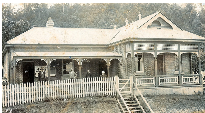
The 1879 Court House with steps down to Murwillumbah Street (Photo Acc. No. M5-7)

In 1879 with the growing population and the streets of the township beginning to form, a new Court House was erected where the present one stands in Main Street. At that time Reservoir Hill spread its base down to the street and the Court House was built on the side of the hill. The first entrance was a walk up the hill from near where Police Lane is now. Later a set of about 18 steps were erected up the bank from street level.